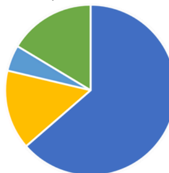
2024 Expenses (unaudited)

■ Cincinnati Programs ■ Other Ministries ■ Celebrate Recovery ■ Administrative ■ Fundraising ■ Non Cash